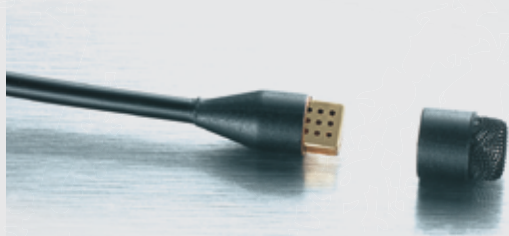
The microphone is supplied with the soft boost grid fitted. This grid must be removed before being replaced by the high boost grid.

The two different protection grids that are supplied with the Miniature Microphones DPA 4060, 4061, 4062, 4063 are for acoustical equalization, according to the placement on the body of the performer. When mounted on the head of the performer, the microphone normally needs a 3 dB soft boost at 8-20 kHz, provided by the soft boost grid.