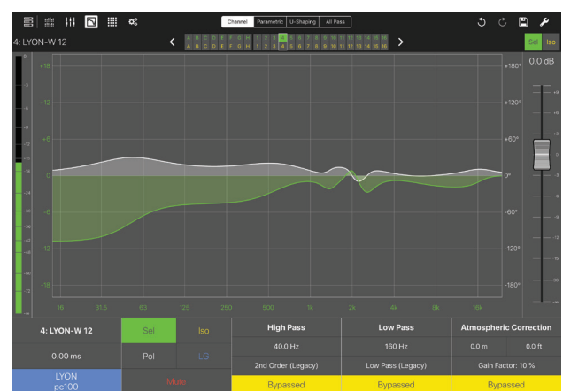
Compass Go Screen