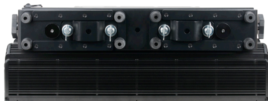
Optional Omega Brackets For Clamps (not included)