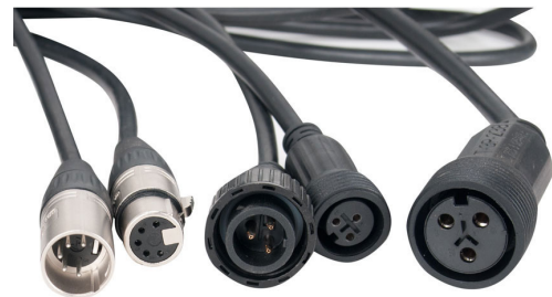
Included Cables 3pin IP to 5pin DMX In 3pin IP to 5pin DMX Out 3pin IP to 3pin Edison Power