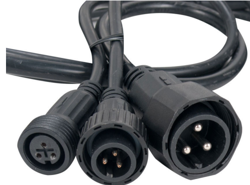
Connections 3pin IP Data In 3pin IP Data Out 3pin IP Power In