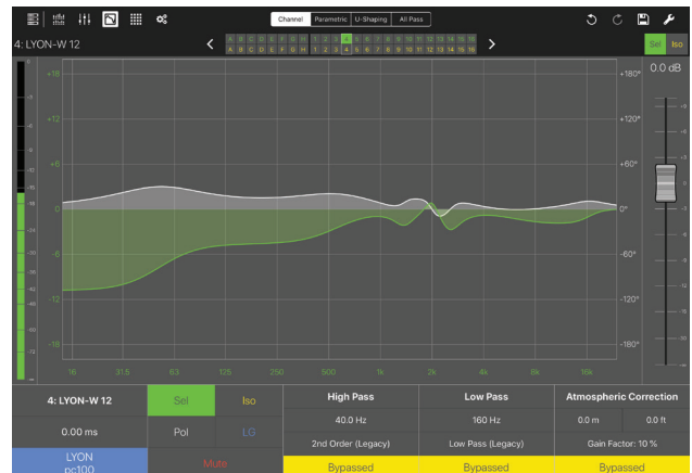
Compass Go Screen