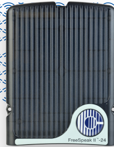
FreeSpeak II 2.4GHz Transceiver Antenna